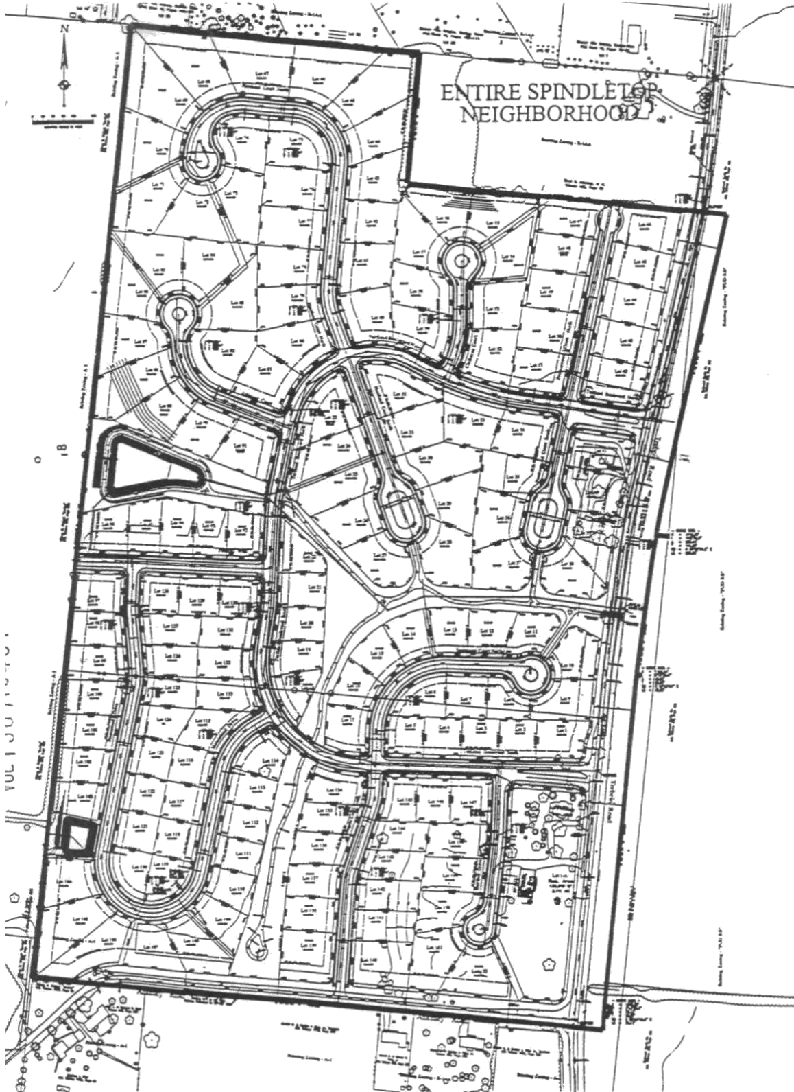
EXHIBIT B Neighborhood Concept Plan